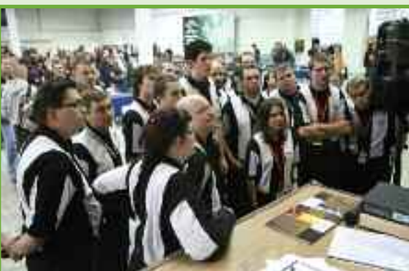
Juggle with the judge's jargon