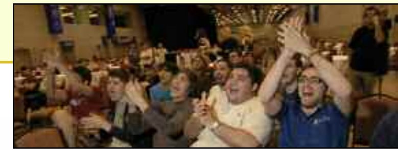
Enthusiastic spectators encourage their heroes in the finals.