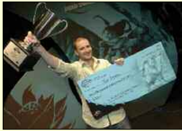
John Finkel, a well-known champion for this special Top 8

The first Pro Tour of 2008 was held February 15-17 in exotic Kuala Lumpur, Malaysia. You can imagine that between two days of Limited, the players sneaked in a bit of tourism! With an amazing Top 8 containing no fewer than two Hall of Famers and two other Pro Tour champions, there were all the names who've been making Magic since ... forever. Leading up to Kuala Lumpur, Jon Finkel was told that Olivier Ruel was close to overtaking him for second place on the all-time list of Pro Tour points. Jon's reply? "So I'd better go and win Kuala Lumpur." No sooner said than done! With a match score of 16-1-1, Jonny Magic ran away with Pro Tour-Kuala Lumpur in purest Finkel style. Will he be there again in Hollywood? That's now the question on everyone's lips... In any case, we'll be there to admire their performances.