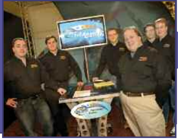
Journalists at work!

Starting on Friday, you can follow everything that's happening at Pro Tour Hollywood by visiting the Tournament Center on www.wizards.com/magic . Know all about everything before anyone else!